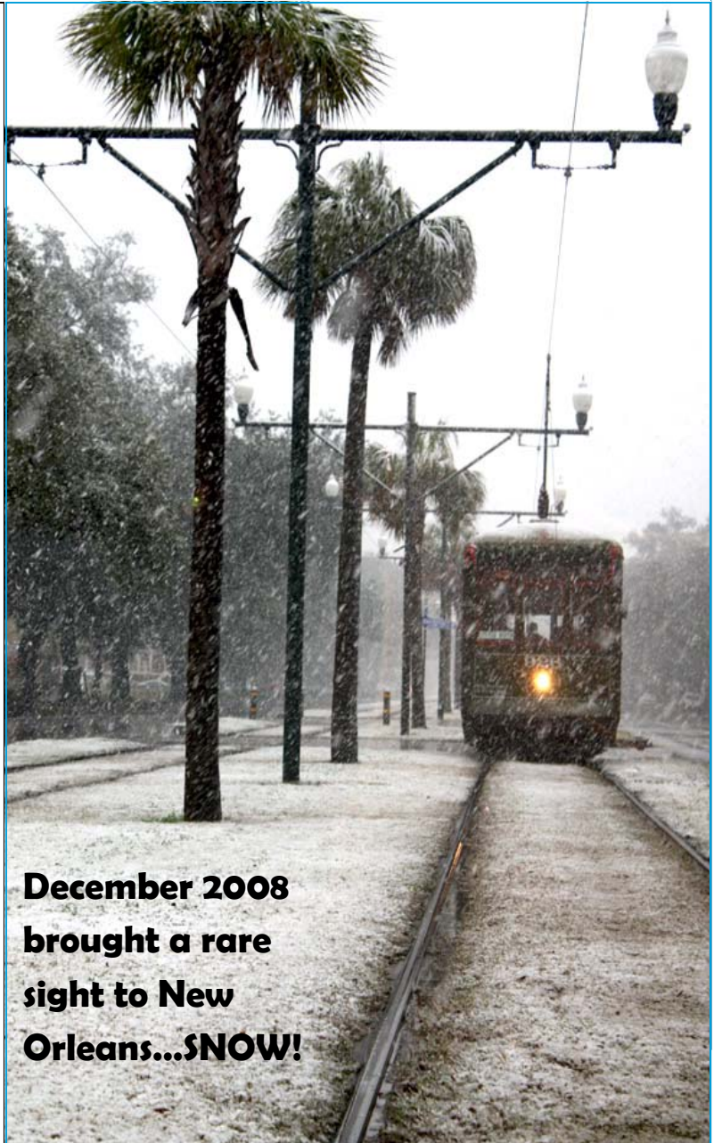
December 2008 brought a rare sight to New Orleans...SNOW!